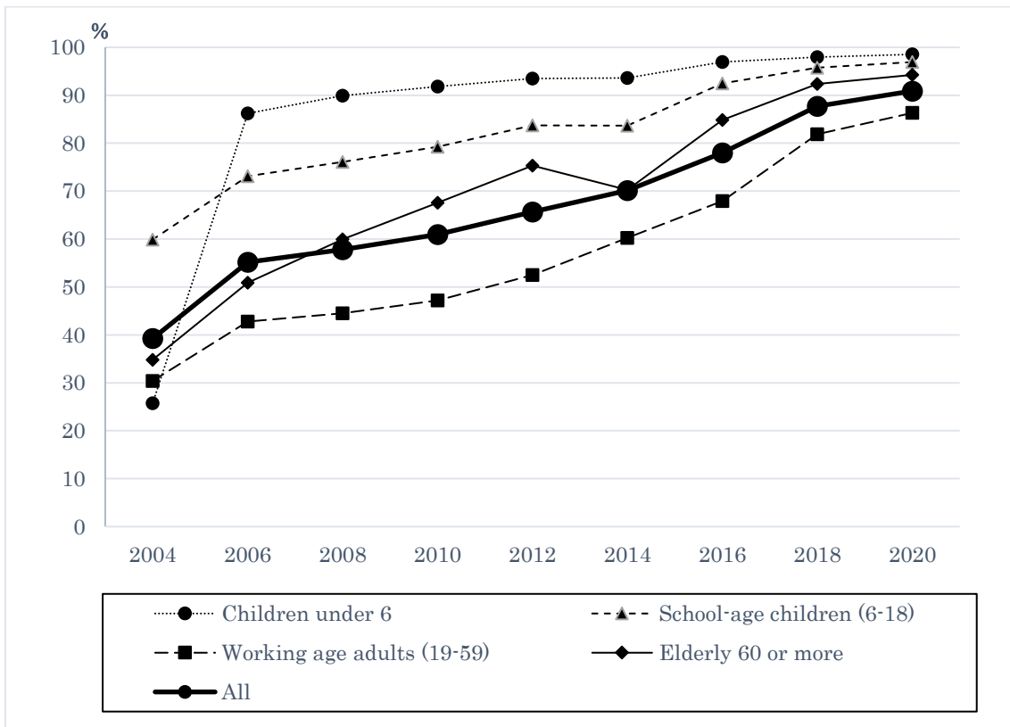
Figure 1. Health insurance coverage rates (2004-2020)