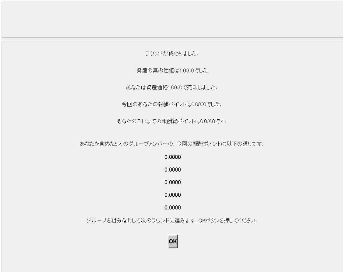
Figure A-4: After All Groups Complete One Round

This round is finished. The true value was 1.0000. You sell the asset at price 1.0000. Your earned points in this round are 0.0000. Your cumulative earned points for all rounds are 0.0000. The earned points of all five group members, including you, are as follows. 0.0000... We move onto the next round after the group members are randomly re-matched. Please click OK.