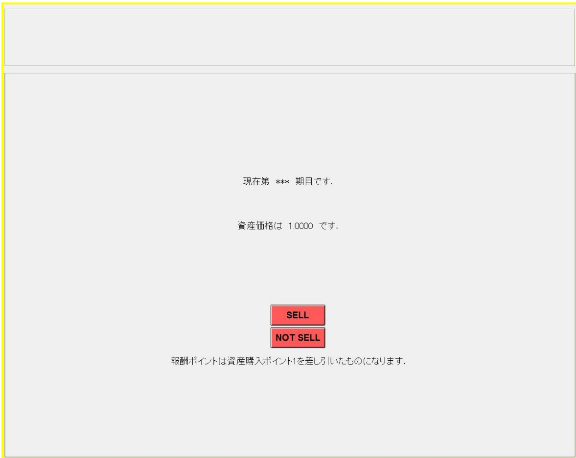
Figure A-1: At the Beginning of Each Round