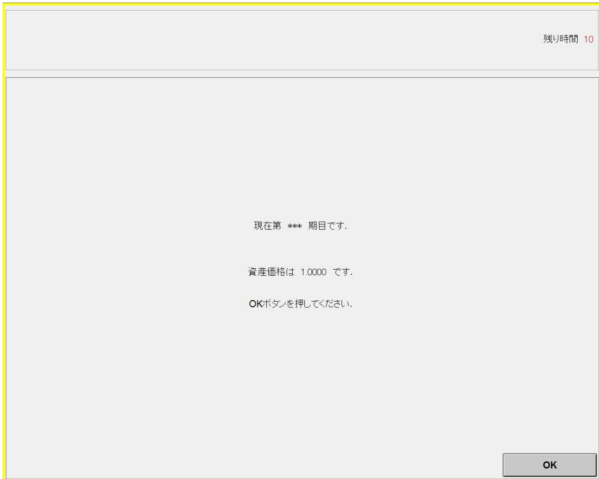
Figure A-3: After You Choose to Sell or One Round is Complete

The current period is ***. The asset price is 1.0000. Please click OK.