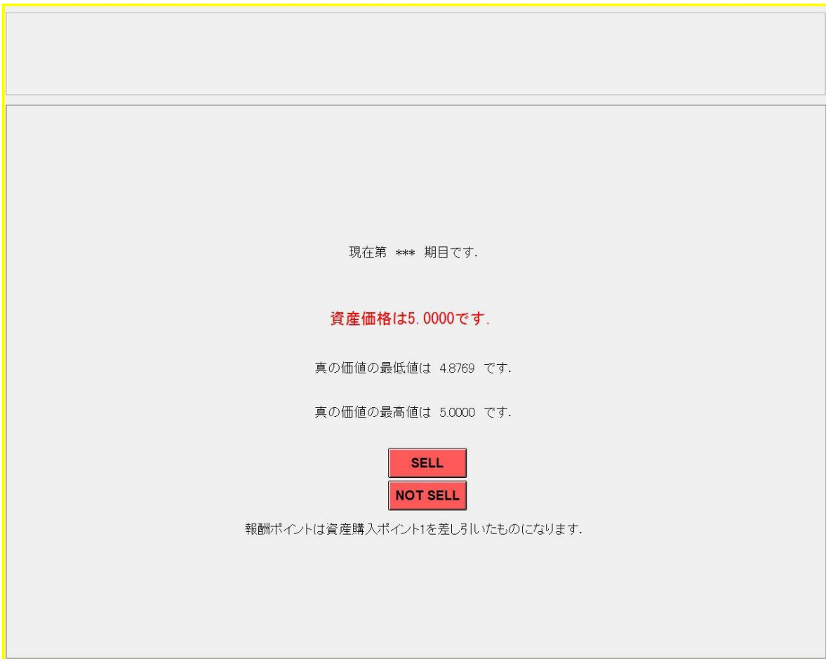
Figure A-2 (a): After You Receive a Private Signal