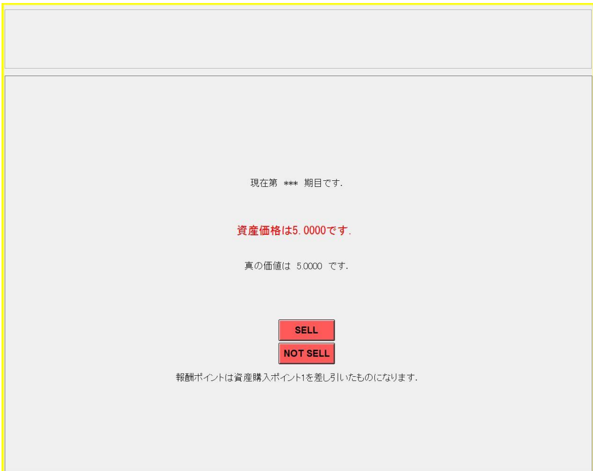
Figure A-2 (b): After You Receive a Public Signal